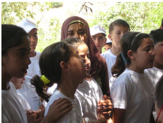
Children's Summer Camp in Yasuf. West Bank Palestine.